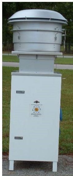
DF-PM2.5DT and DF-PM10DT