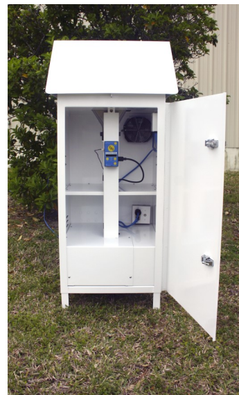
DF-604DT and DF-60810DT