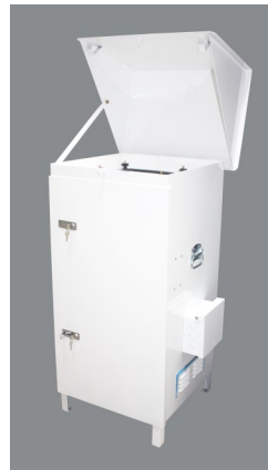
High Volume Air Sampler