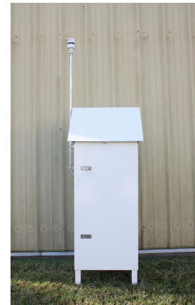
High Volume System