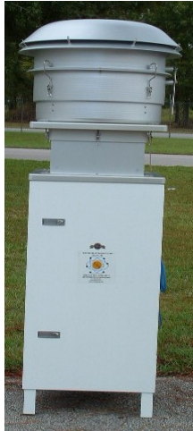
GAS-PM10DTE and GAS-PM2.5DTE