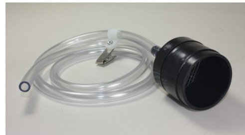
Lapel Filter Holders