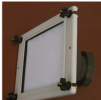
8" × 10" FJ2100