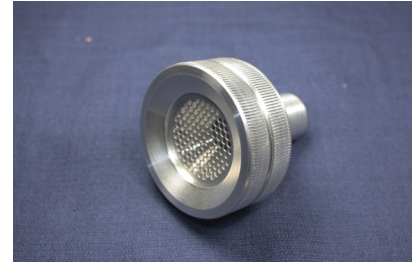
Aluminum Open-face Style