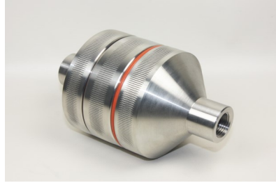
Stainless Steel In-Line Style