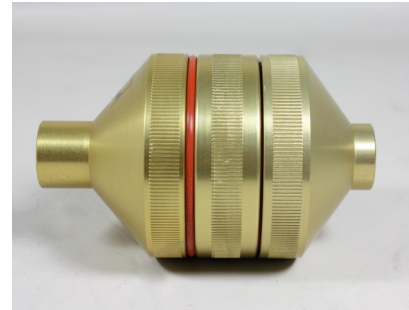
FJ-44 Aluminum In-Line