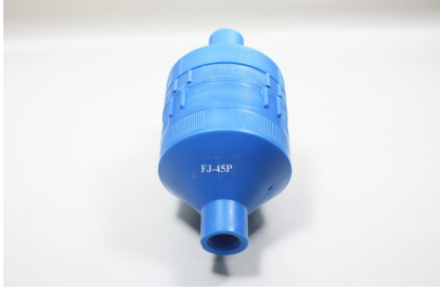
Plastic In-Line Style

Filter Holder Materials: Plastic, Aluminum and Stainless Steel