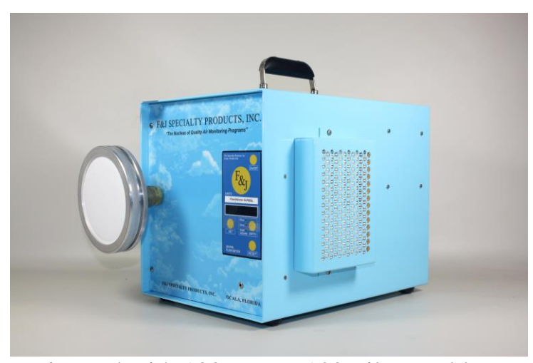
Pictured with 130mm FJ-130 Filter Holder