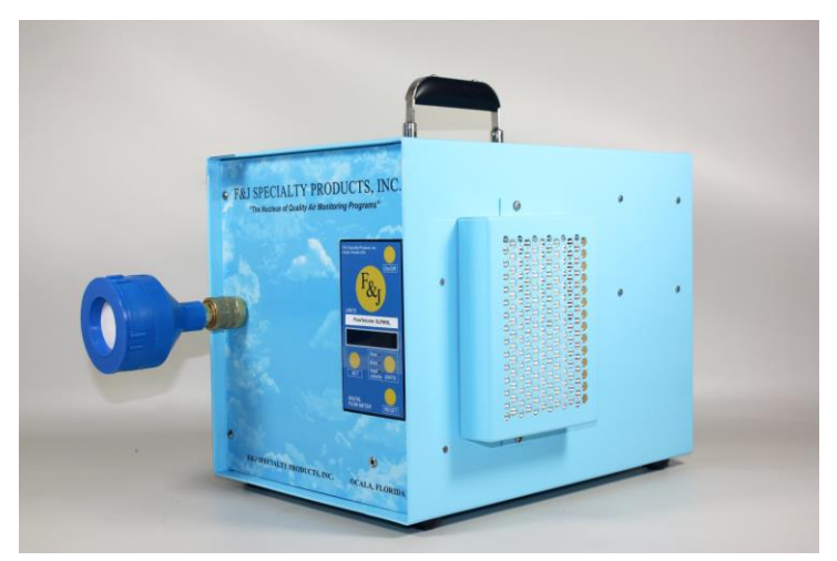
Pictured with 47mm FJ-46P Filter Holder