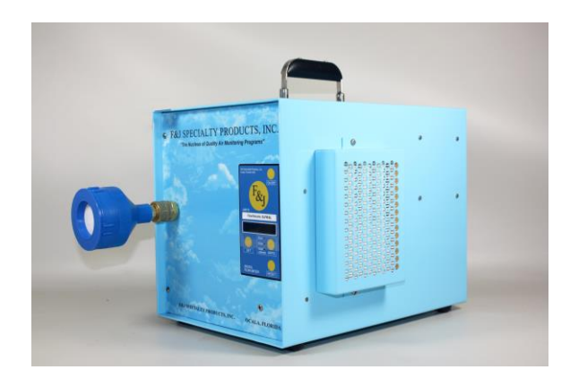
"Lightweight: ~ 16 lbs."