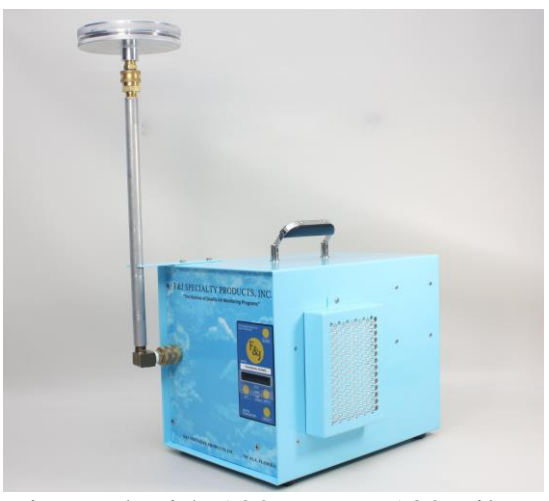
Pictured with 130mm FJ-130 Filter Holder Vertically Mounted