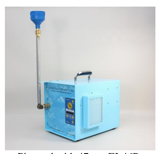
Pictured with 47mm FJ-46P Filter Holder Vertically Mounted

Tel: 352/680-1177 • Fax: 352/680-1454 • Email: fandj@fjspecialty.com