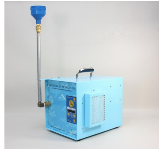
Pictured with 47mm FJ-46P Filter Holder Vertically Mounted