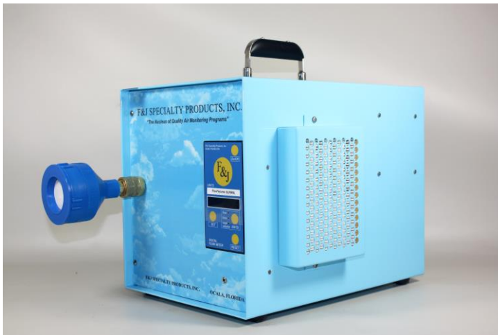
Pictured with 47mm FJ-46P Filter Holder