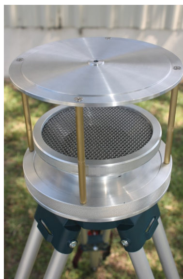
Sample Inlet Without Cover