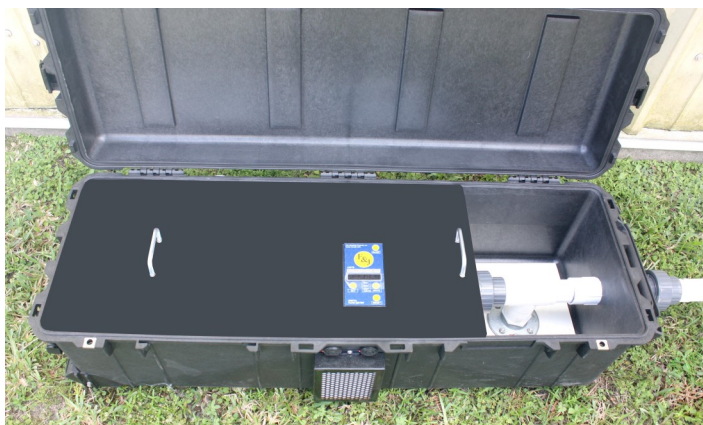
Transportation Storage Case for Air Sampler