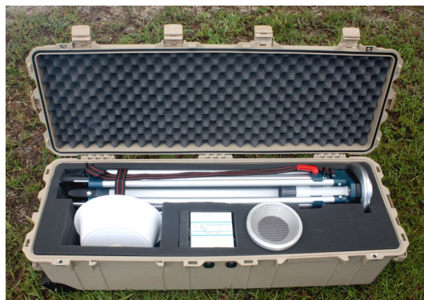
Transportation Storage Case for Tripod, Filter Holder with Rainshield, Particulate Filter Paper