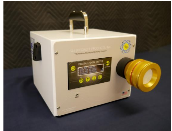
Shown with optional filter holder FJ-34