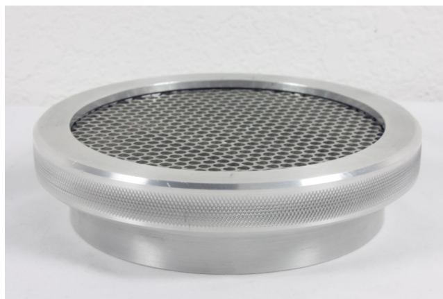
Filter Holder Standard Design