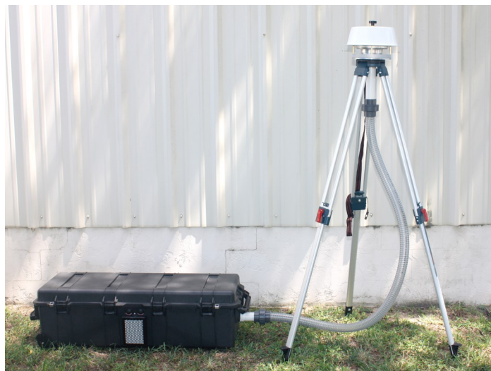
GAS-ERHV-DTE-CFH Global Air Sampler Electronic Flow Management System Mobile High Volume Air Sampler for Circular Filter Media