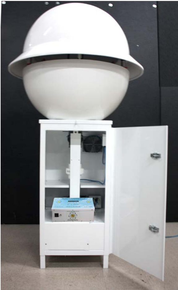
Frontal View – Sample Inlet Closed