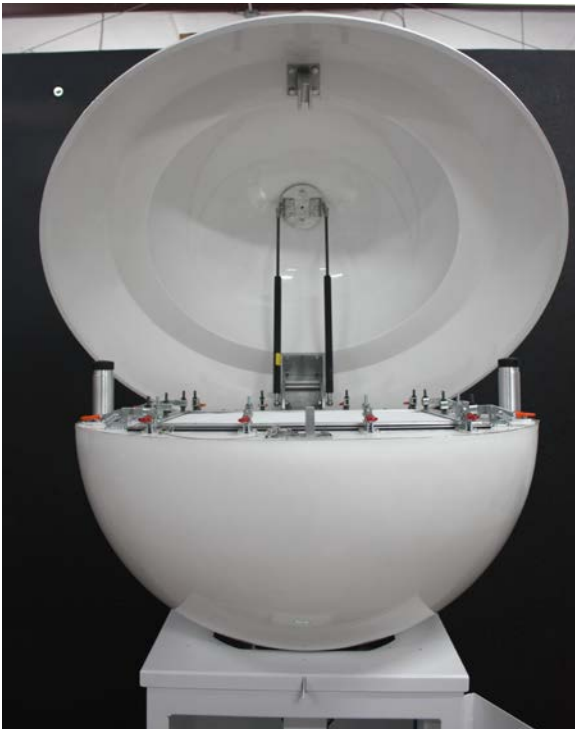
View of Open Sample Inlet