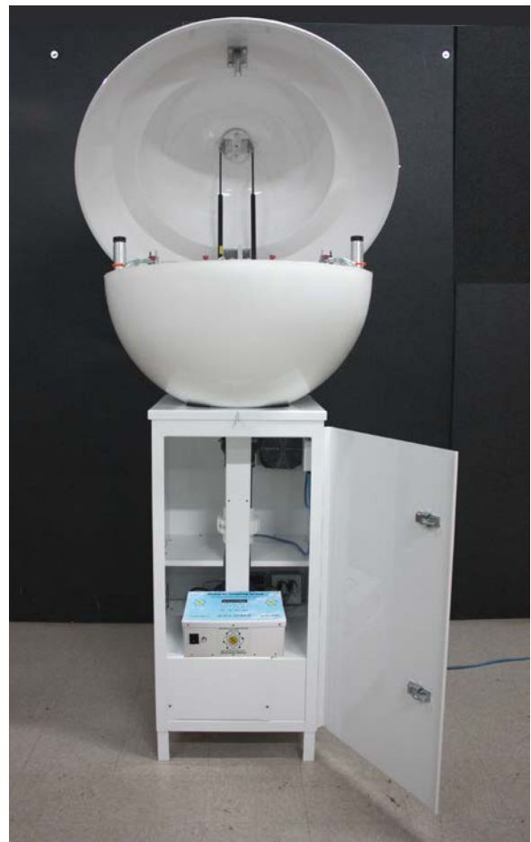
Frontal View – Sample Inlet Open