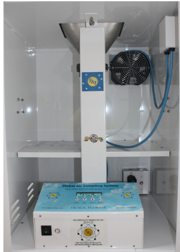
Close up of Global Air Sampler Electronic Module