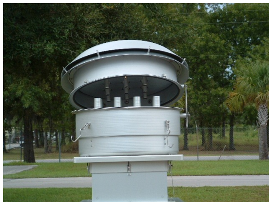
View of PM10DE Size Selective Inlet illustrating interior features