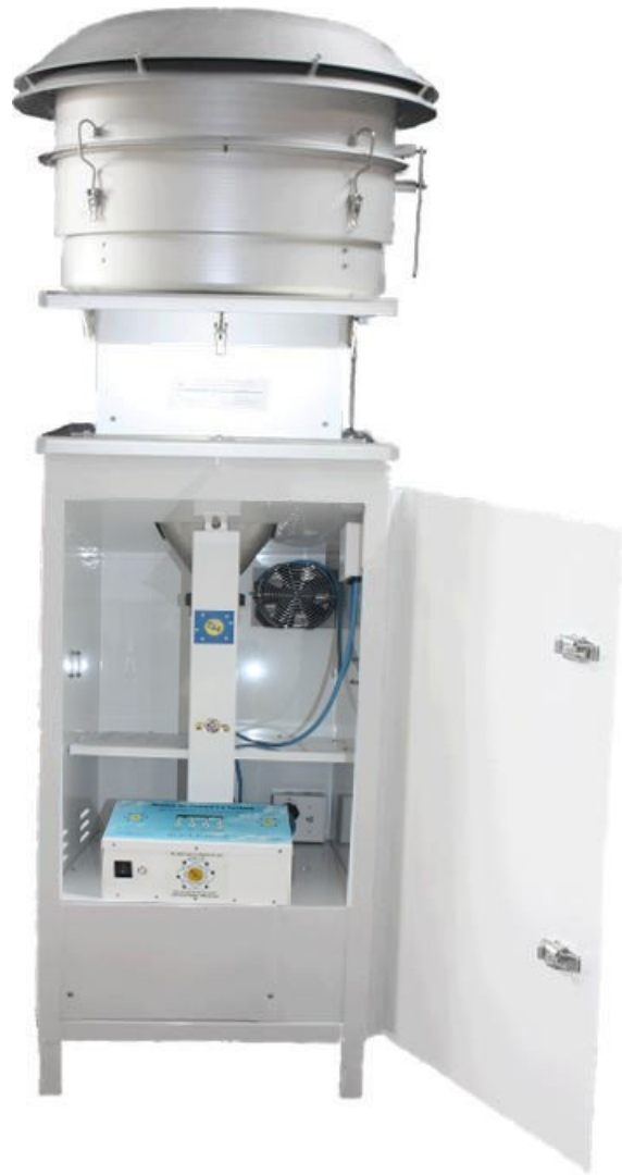
GAS-PM2.5DTE Series System Enclosure Door Open