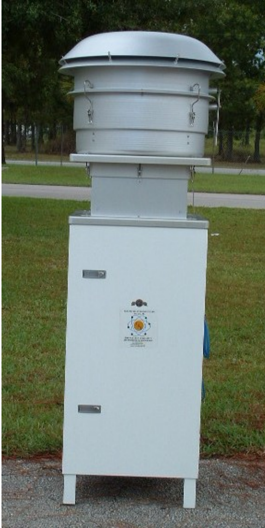
GAS-PM2.5DTE Series System Normal Operating Scenario