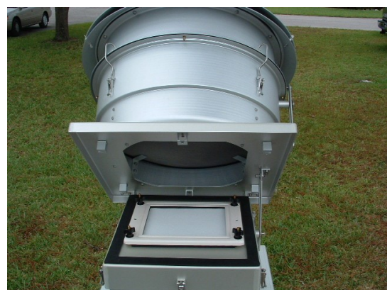
GAS-PM2.5DTE Series System PM2.5 Inlet Open Position for Access to Filter Paper