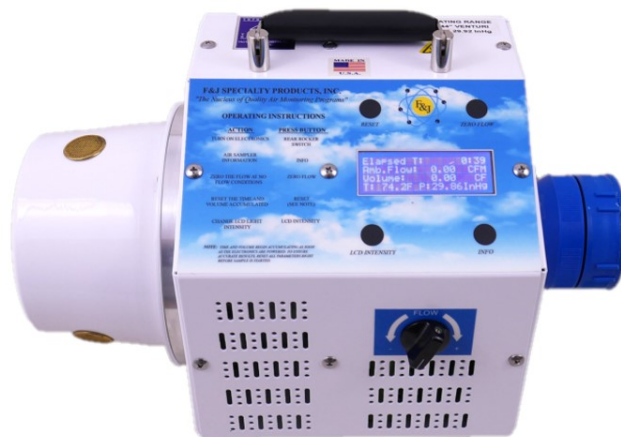
Shown with optional F&J filter holder